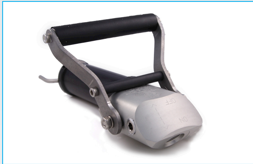
FV103-4-000-0 45° Fill Valve

CNG and Bio-Gas Dispensers for Car, Bus and Truck filling & CNG Bio-Gas Trailer load/unload systems.