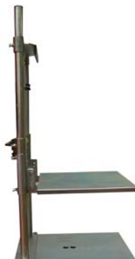
The picture shows the Folding Platform (optionally available)