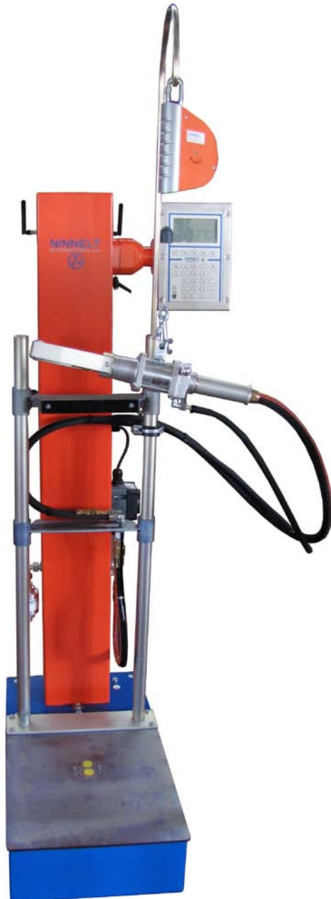
Design: WAER 100 ex/e with Pneumatic Connection, Type 6124